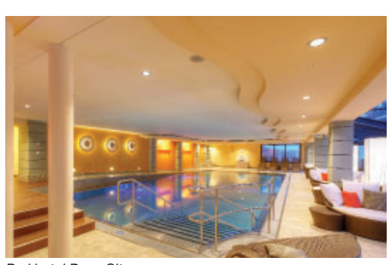
Parkhotel Beau Site