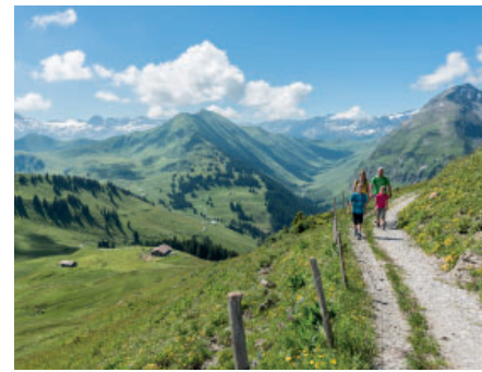
Walking holiday in the Valais