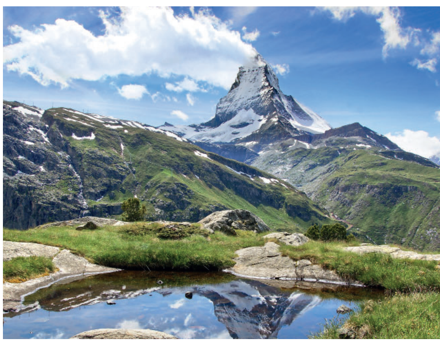
The Matterhorn above Zermatt

The second walking day in Zermatt is given to the sublime Five Lakes Walk (5-Seenweg). This trail is perhaps the most popular of Zermatt's 400km of trails and offers amazing scenery over a 9-kilometre route. As suggested in the name, the easy hike passes by the five mountain lakes of Stellisee, Grindjisee,