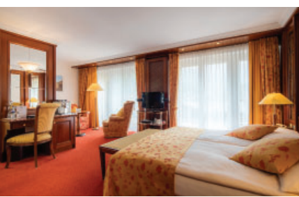
Parkhotel Beau Site