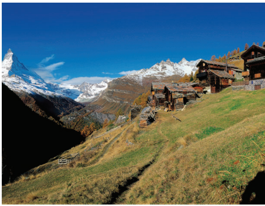
Landscape near Zermatt

Your last walking day in Zermatt gives a choice of two trails, both of which have significant sections of ascent and are therefore more strenuous than the previous walks. Those with a head for heights and a lust for adventure start the day by heading on the train down the valley to the town of Randa. From here, an 8.6 km hike takes visitors through larch forests to the Hohtschugga viewpoint and then reaches the Charles Kuonen Suspension Bridge. The pedestrian bridge spans 494 metres making it the longest of its kind anywhere in the world, running 85 metres above the Grabengufer below. Swaying walkers will take nearly 10 minutes to cross the aerial pathway, stopping regularly to let others pass in the other