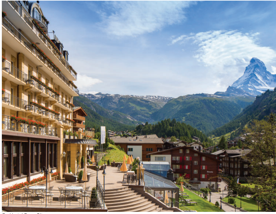
Parkhotel Beau Site

arched ceiling and doorways, and the unique style of wooden floor. Guests are also free to use the Wellness and Beauty centre, complete with large swimming pool, two whirlpools tucked away under an exposed rock wall, and tranquil treatment rooms. Relax in the sauna, looking out across the mountains, or beside the panoramic windows of the winter garden in one of the large armchairs. A stay of a few nights or a week at the Parkhotel Beau Site gives you plenty of time to relax and enjoy the facilities available at the hotel, the comfort of your room, and to then explore the walking trails and village of Zermatt.